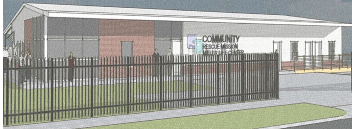
F Street Elevation