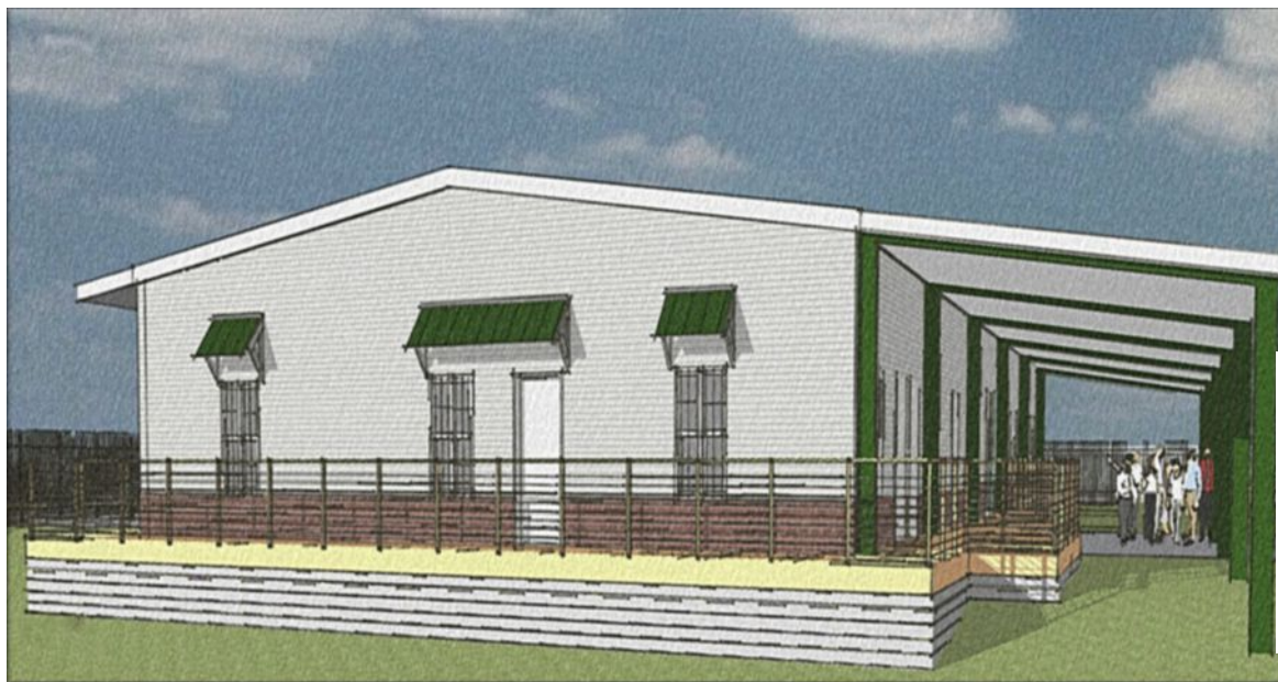
View from 4th Street